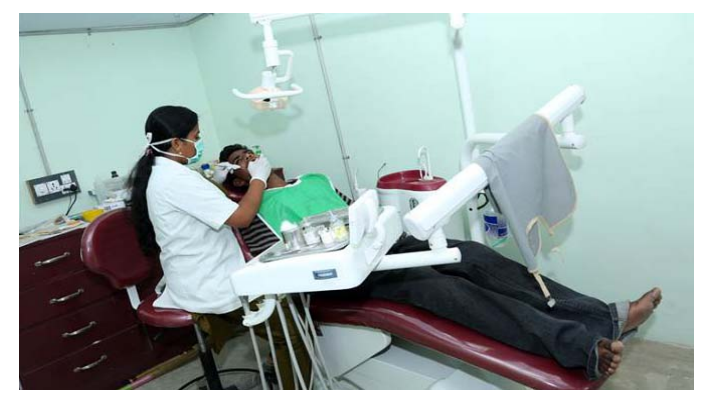
Unit financed under UYEGP Scheme

The scheme will be advertised through print and electronic media. The eligible residents of the district can filetheapplicationthroughonlineportal((http://msmeonline.tn.gov.in/uyegp)https://msmeonline.tn.gov.in/uyegp/index.php((((http://msmeonline.tn.gov.in/uyegp/index.php))and furnish the pdf format of the online generated applicationalong with project profile, copies of certificates for proof of educational qualification, nativity, community, Exservicemen (wherever applicable) and proof of physically challenged to the concerned General Manager, DistrictIndustries Centre in person or by post within 7 days from the date of filing.